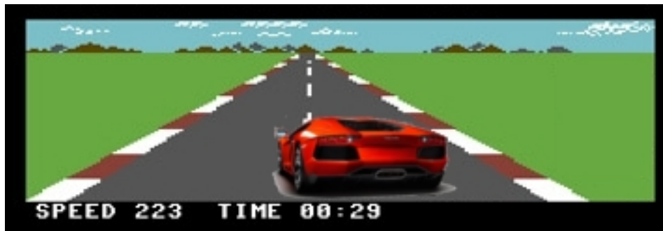
Figure 6: Mock turned to the left.