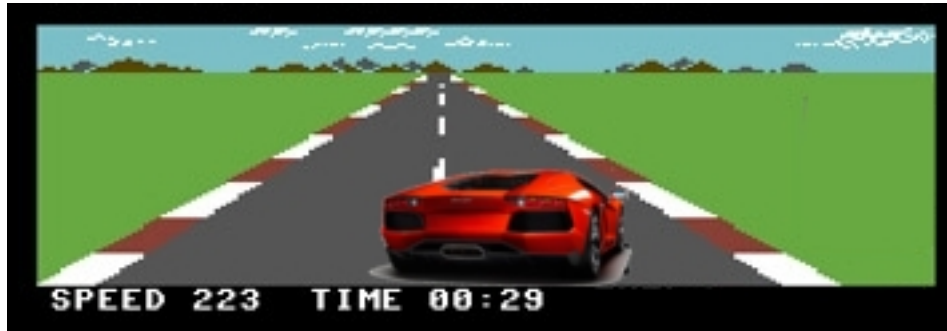
Figure 7: Mock turned to the right.

There will also be brake lights for every perspectives, these brake lights will appear when the player tilts the smartphone backwards.