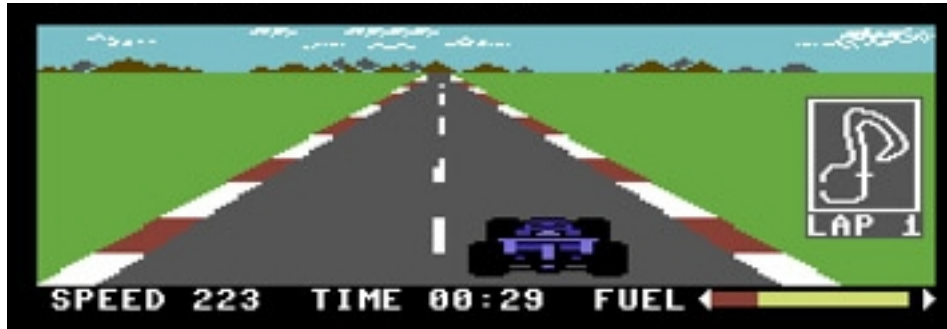
Figure 1: Screenshot of PitStop2 [1]

Pitstop 2 was the first 3D racing game to implement a split screen [2], however my game will not have a split screen but only one due to the fact that the player will not be competing against other players, but has detailed in section 5 it will be competing against time.