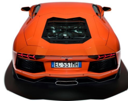
Figure 4: Rear of Lamborghini LP 700-4 Aventador [3].

The player is represented by a Lamborghini Aventador LP 700-4 from a rear third-person perspective.