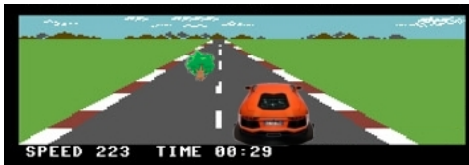
Figure 3: Example of an obstacle, in this case, a tree.

These obstacles will be static, in other words will not move, so if the car collides with them, the only way to continue is by going around them.