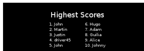
Figure 10: Mock of the screen with highest scores.

After the player inserts his name, a screen with the highest scores is displayed.