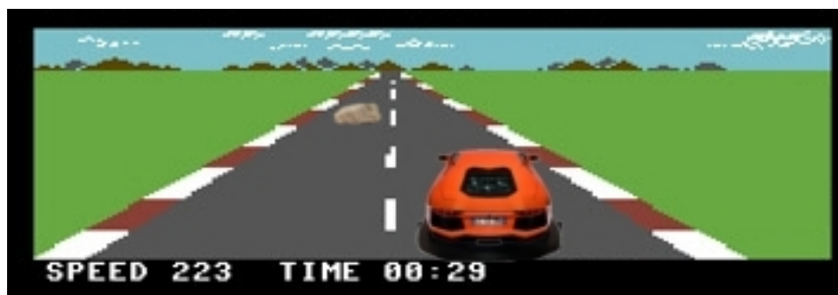
Figure 2: Example of an obstacle, in this case, a rock.

The obstacles will be on the track, and if the player collides with any of them, the speed of the car will be reduced drastically. These obstacles include other cars and various random objects, such as trees, rocks among others.