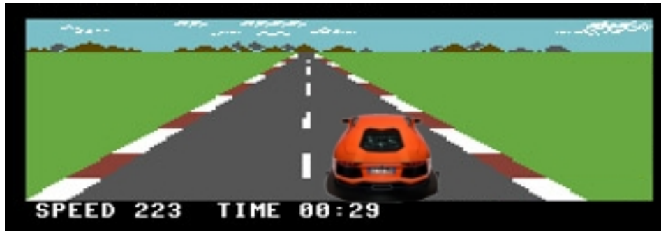
Figure 5: Mock of the final environment with the player representation.

The player will see the car in three different perspectives according to the inclination of the smartphone: